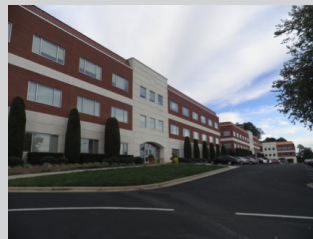
Six Forks Place I