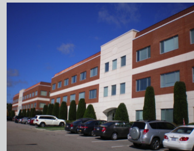
Six Forks Place II

Hobbs Properties 343 E. Six Forks Road Suite 300 Raleigh, NC 27609 Phone: 919-828-9999 Fax: 919-828-9888 www.hobbsproperties.com