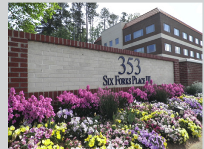
Six Forks Place III