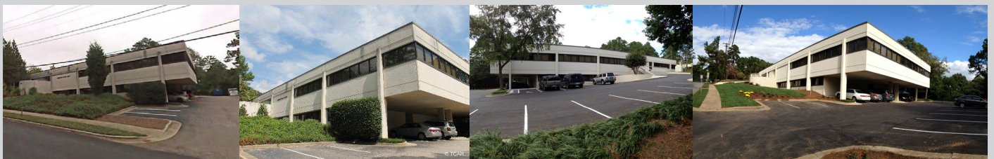
A before and after look at Anderson Plaza West (APW), 3008 Anderson Drive.

- CTMG , founded in April of 2004, is known as the only organization providing Adaptive Investigative Site Management sources as a Site Specific Research Organization (SSRO). Their services allow them to enable clinical trial protocol completion as intended at each Investigative Site, with superior data acquisition per forecast timelines, 100% of the time.