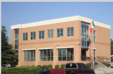
336 E. Six Forks Road