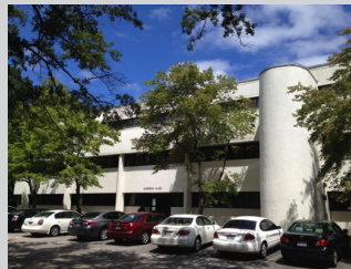
100 E. Six Forks Road