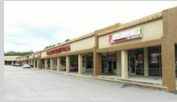
Starmount Shopping Center

Starmount Shopping Center -10,000 Sq. Ft.